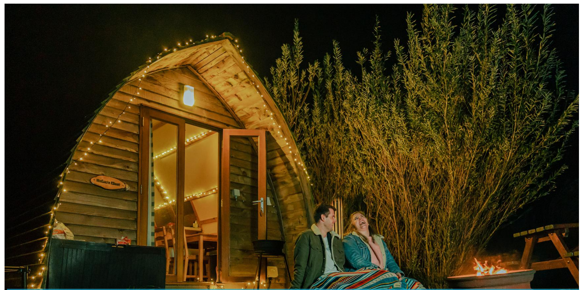
Stay Somewhere Different