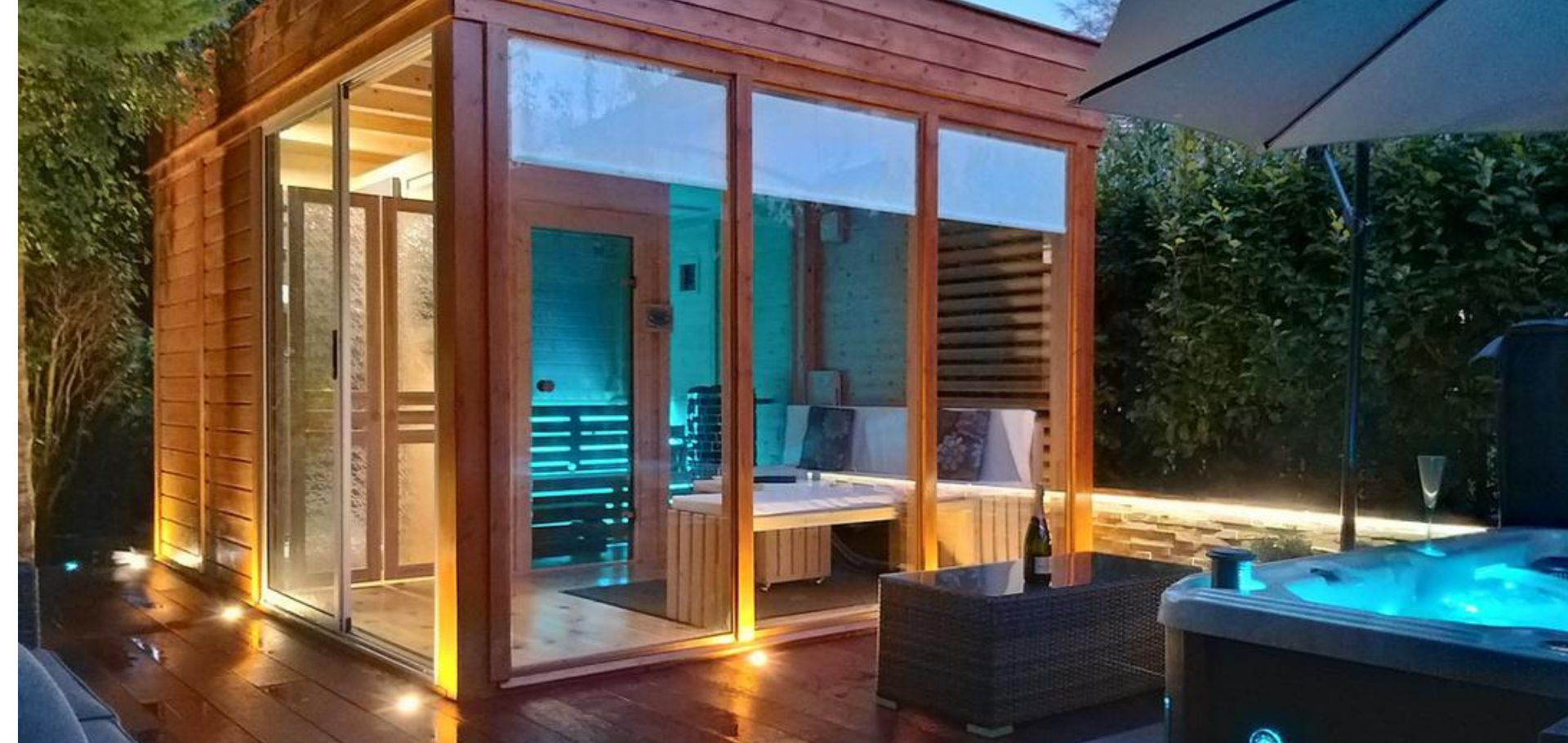
B&B and Guest Accommodation