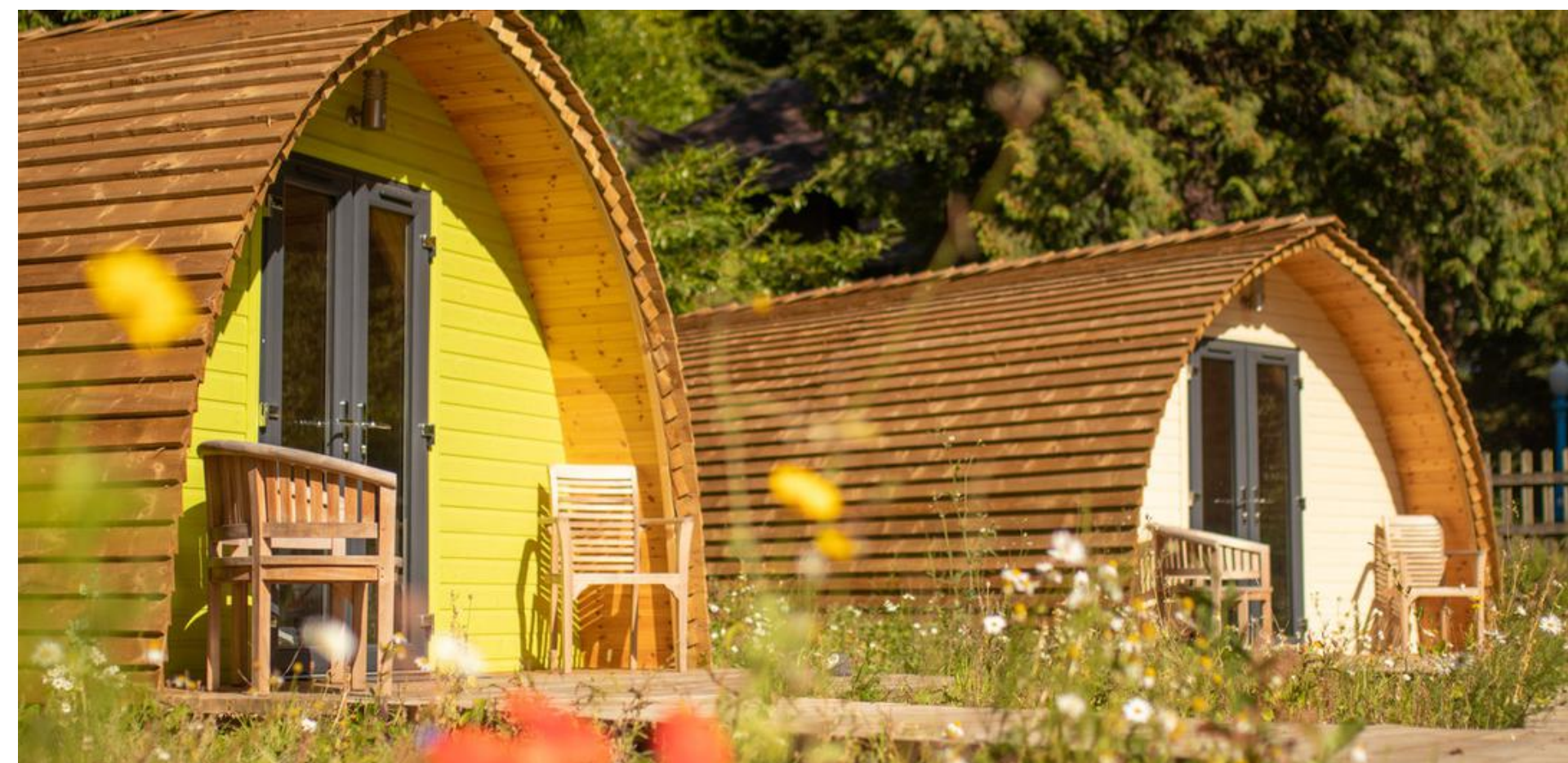
Camping and Glamping